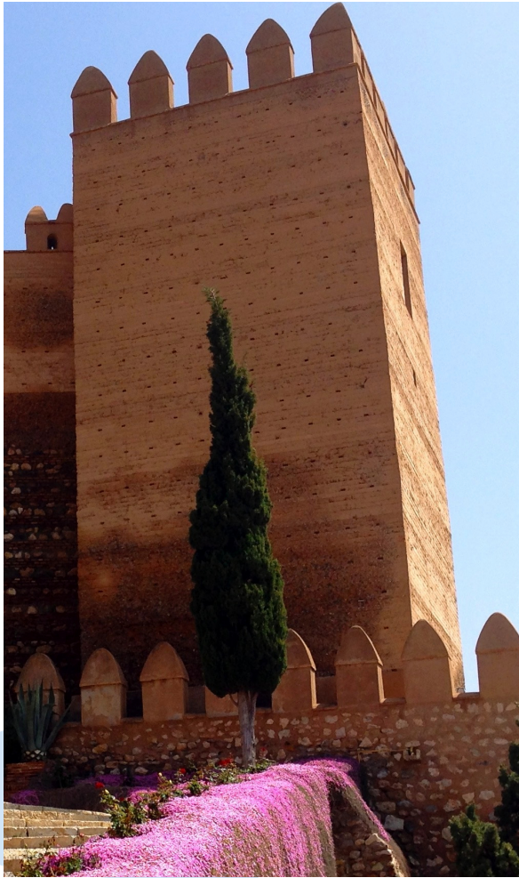
Almería's Alcazaba is just one of the many scenic landmarks in the city.