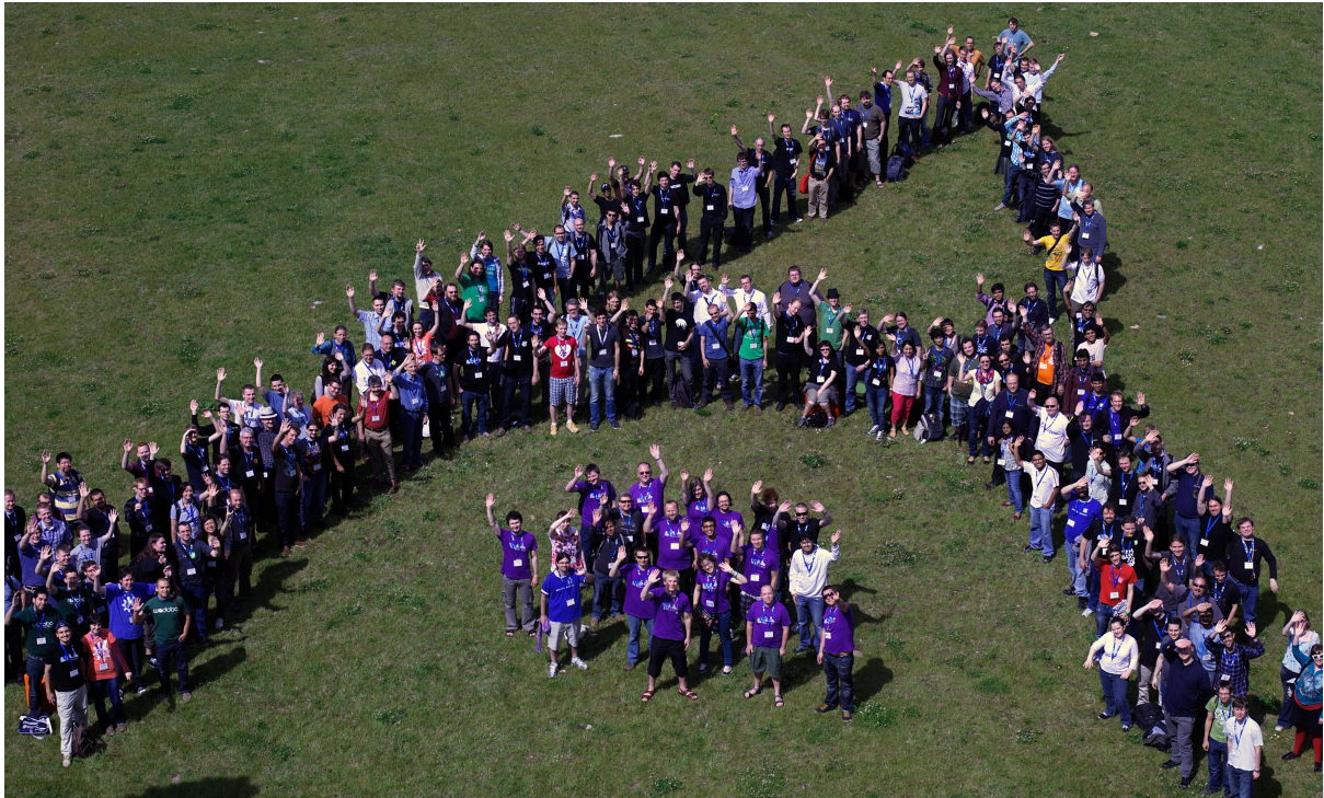
Community members pose for the Akademy 2012 group photo.